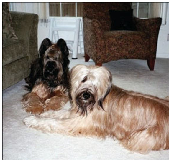
Both of Faith Rubenstein's Briards, Dakota and Aubrey, tore a cruciate ligament at different times – turning Faith into something of an expert on dealing with the injury!

Swimming is such effective exercise for injured dogs that many veterinary clinics have installed swimming pools. "Dogs who can't yet do weight-bearing exercises can start in a pool," she says, "and as they get stronger, they're able to progress through the exercise program. I check their progress in weekly appointments and make adjustments as